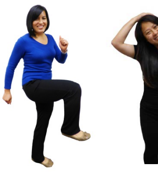
March In Place