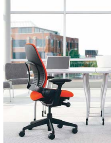
Steelcase “Leap” Task Chair

This is one rendition of a computer workstation. It provides a user adjustable hand crank computer table (WorkRite Sierra base) and a maintenance adjustable rectangular work surface