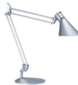
Diffrient Work Light II